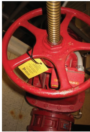
Outside screw and yoke