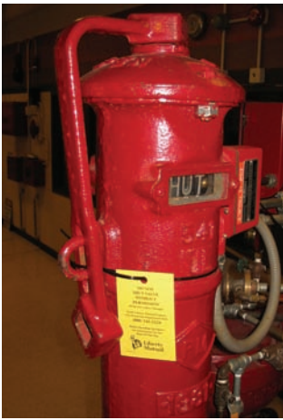
Post indicator valve closed