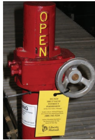
Post indicator valve open

whether the valves are open or shut. A common example is an outside screw & yoke (OS&Y) control valve or a post indicating valve (PIV).